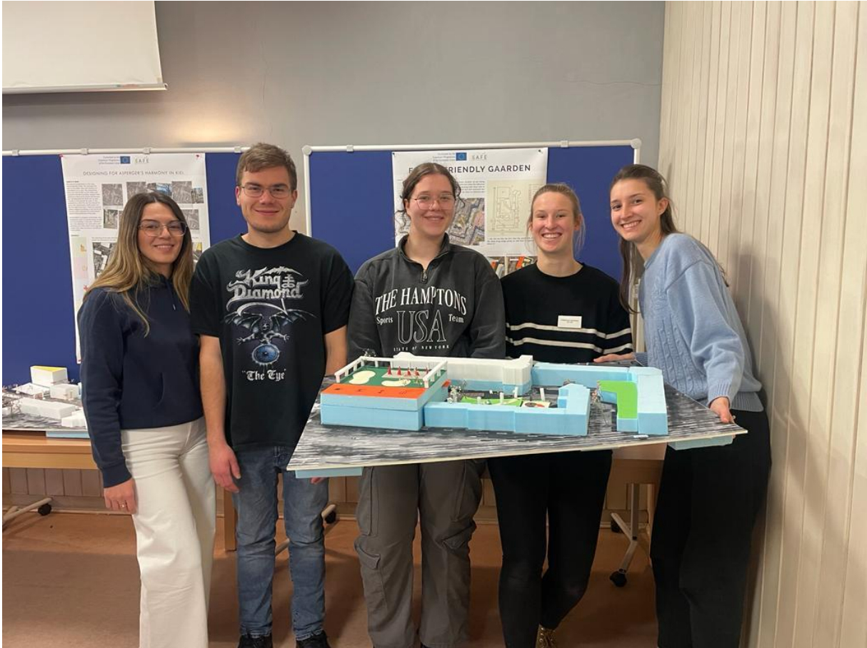
Figure 8: Group 4 - feeling proud of ourselves!

After we were given the certificates, we went to pack and buy food. We met with everyone in Bambule bar where we exchanged our experiences of the week and said goodbyes to each other.