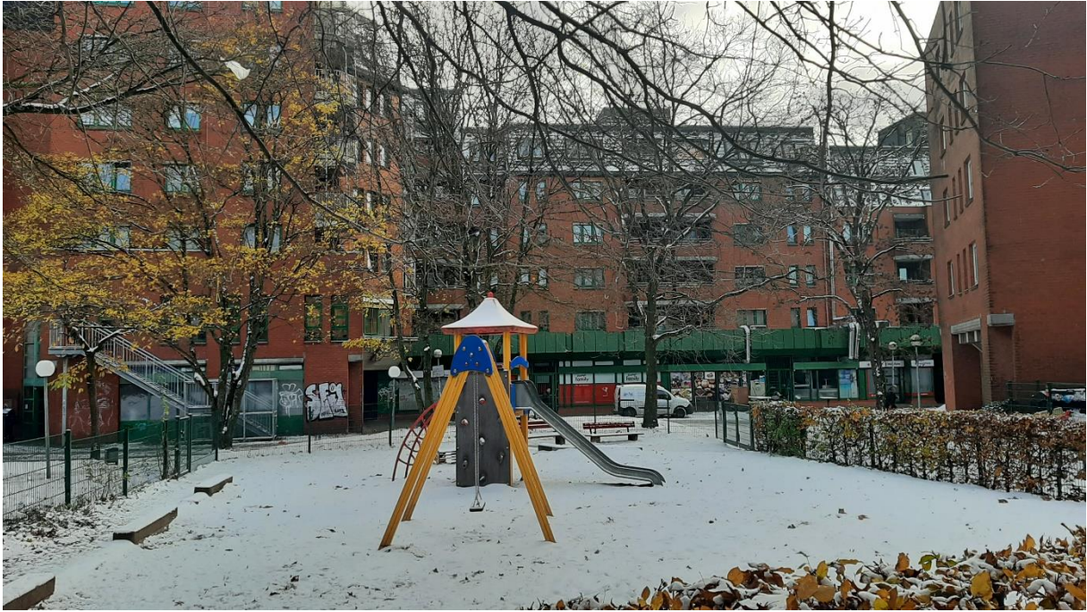
Figure 4: Location of the safety walk.

The Spanish group then presented us the concept of accessible tourism which I found quite interesting.