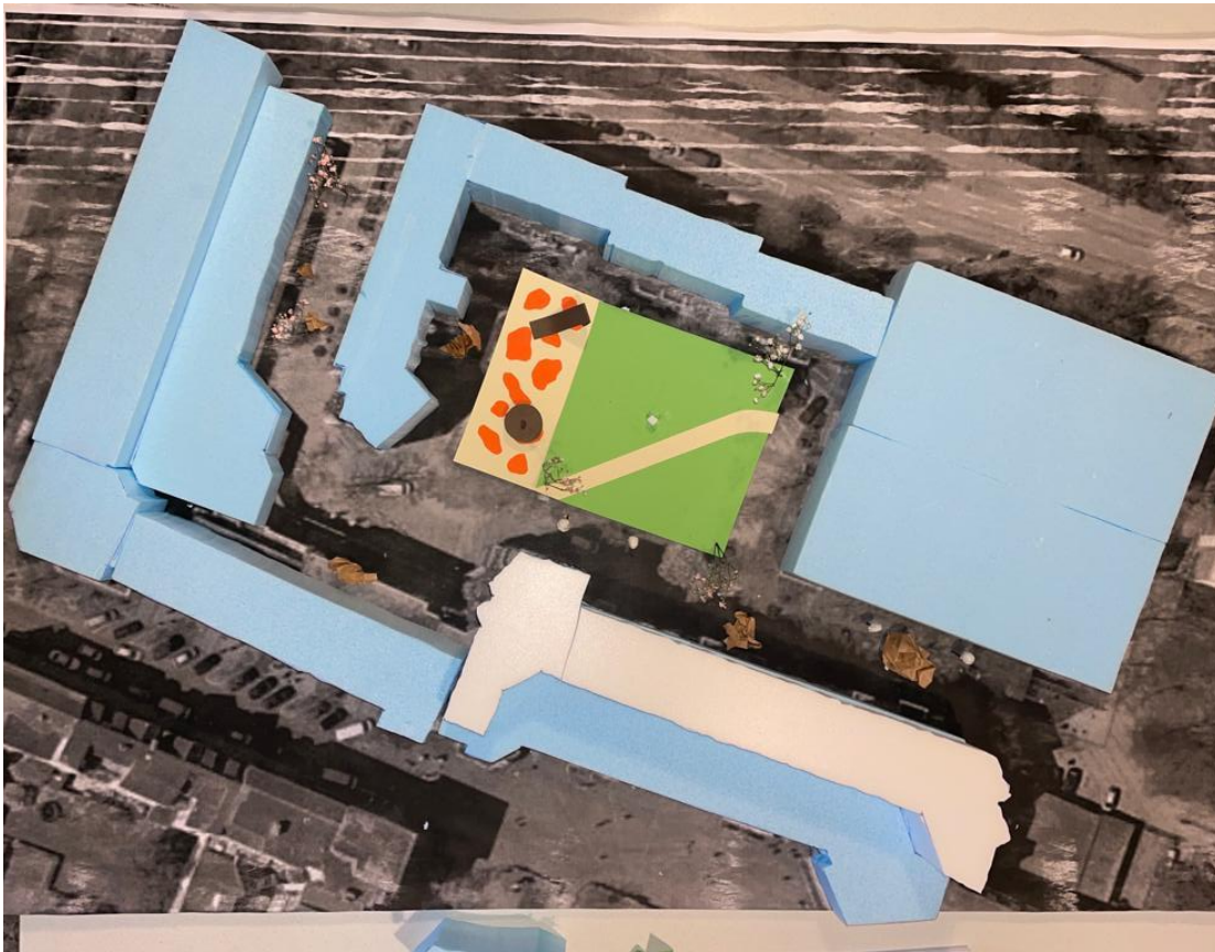
Figure 6: Model of the location.

Thursday was reserved for future thinking and scenario making. The Finnish professors had a lecture on future thinking and the Polish group introduced us to different aspects of social policy (accessibility, integration, education...). With the group we made a SWOT analysis to organise the main characteristics of the location. It was very useful for when we started to think about the 5-, 10-, and 20-year scenarios. For the 5 years we tried to suggest small changes and for 20 years a more daring scenario. Our propositions were not perfect but were acceptable based on the time and resources we had. We had fun making models of the scenarios and everyone was included in the discussion on what we could suggest. I prepared the poster with all the material we made. At the end of the day, we were tired but satisfied with the result.