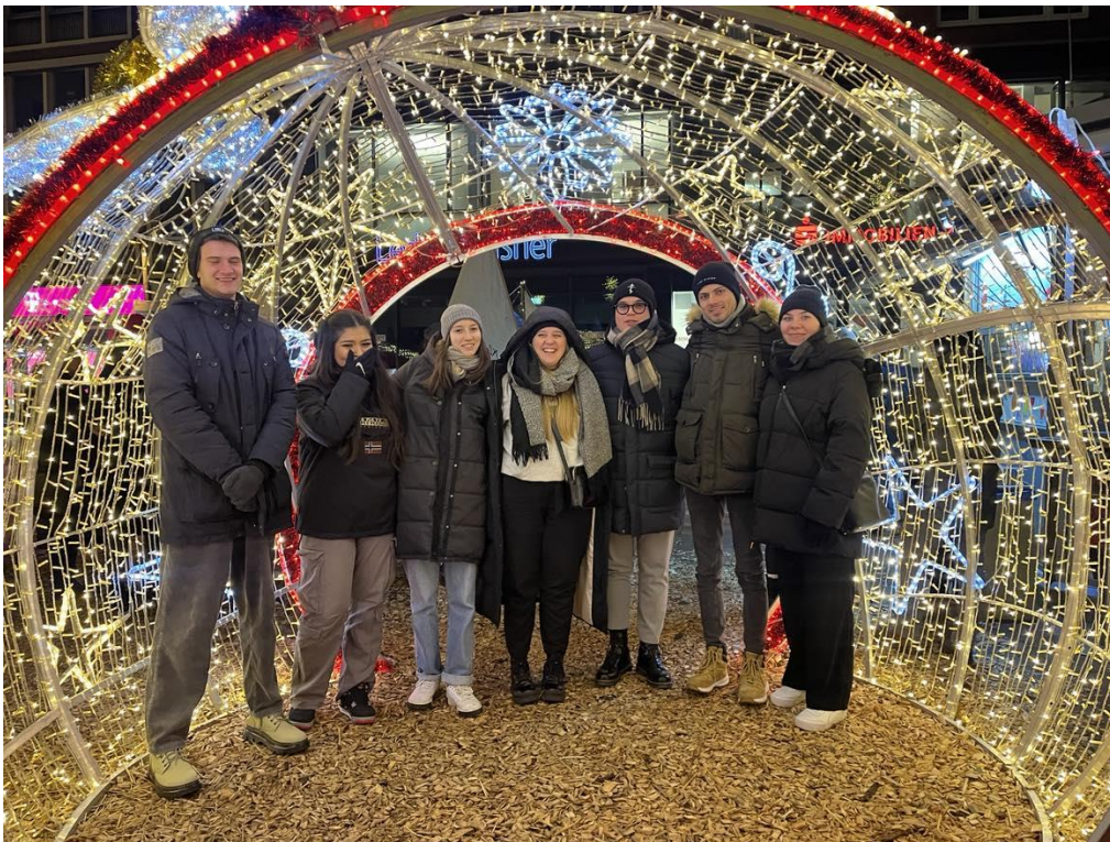
Figure 2: Slovenians in the Christmas market.