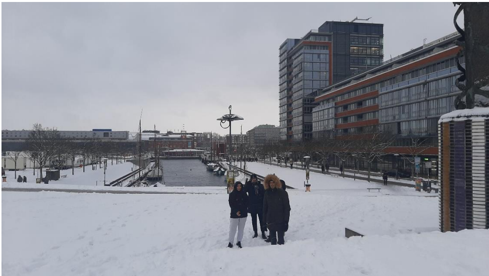
Figure 5: City walk in the snow.

After lunch, we all walked to the main railway station for a city tour. At that point, the snow had fallen quite a lot so in was a bit tiering and cold, but the tour was still very interesting. The tour guide explained to us a bit on the history of the city and its role in German economy and transport, and how its history shaped the Kiel as it is now. He put a lot of emphasis on the negative aspects of war and how it affects the city. He also explained the touristic character of Kiel that comes with the cruise ship terminal. After the walk I had a better understanding of the city and its characteristics.