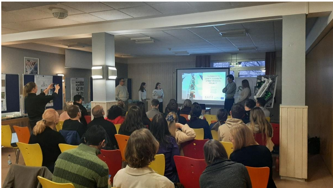
Figure 7: Final presentations of the projects.

The presentations were very enjoyable – it was amazing to see how much a group of strangers from different backgrounds can do in just a few days. The topic was challenging so I did not take the result for granted. Our group was satisfied with the finished materials.