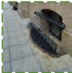
2. bad choice of decorations to hide water systems, not safe and it's not stable