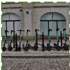
4. scooters don't respect the traffic rules & signs