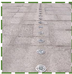
1. lighting on the floor, good to orientate in bigger open spaces