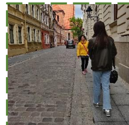
6. kind of a shared space, but pavement too narrow, so it's not safe and comfortable