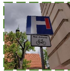
3. traffic signs only in polish