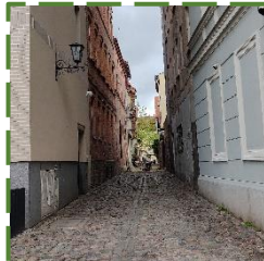
5. narrow alleys that don't have enough lights create unsafe environments at night